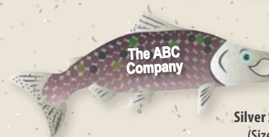
Silver Salmon $1000 (Size: 10.5" x 5")