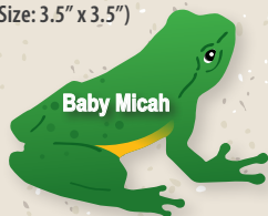
Baby Frog $100 (Size: 3.5" x 3.5")