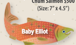
Chum Salmon $500 (Size: 7" x 4.5")

Three sizes for more personalized inscriptions. Fish are displayed indoors along the Salmon Run Wall.